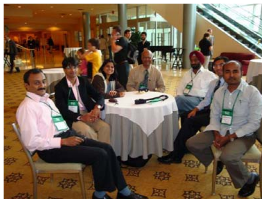
Indian Weed Scientist at IWSC Vancouver